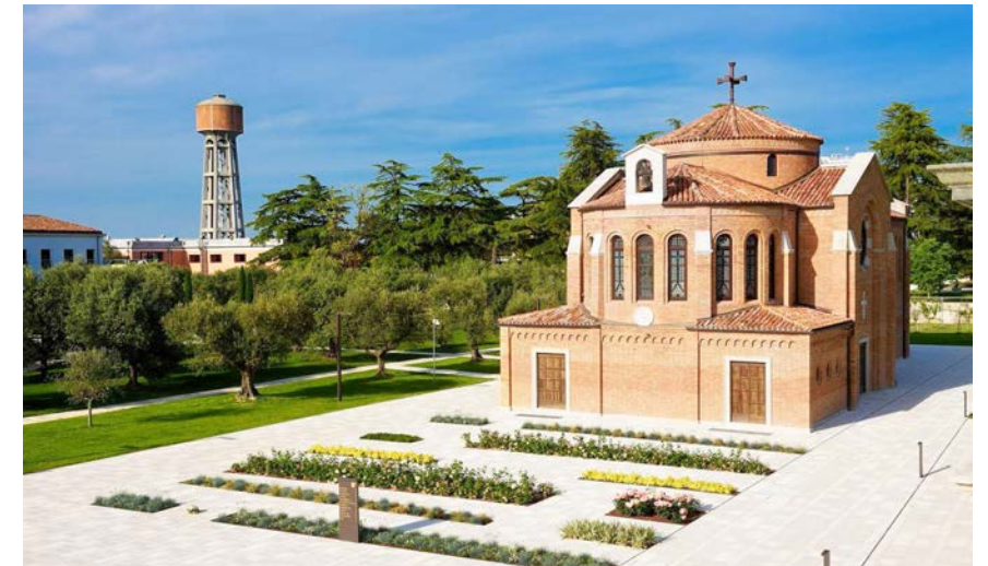
Sacca Sessola is one of the largest islands of the Venetian Lagoon. A refined recovery intervention transformed the island into a luxury resort with a total area of 32,000 sqm that hosts 206 rooms, a conference centre, spa, indoor and outdoor pools, restaurants and bars, a marina house and a heliport. The intervention included the construction of a new water channel, the rearrangement of green areas and the renovation of a small church.